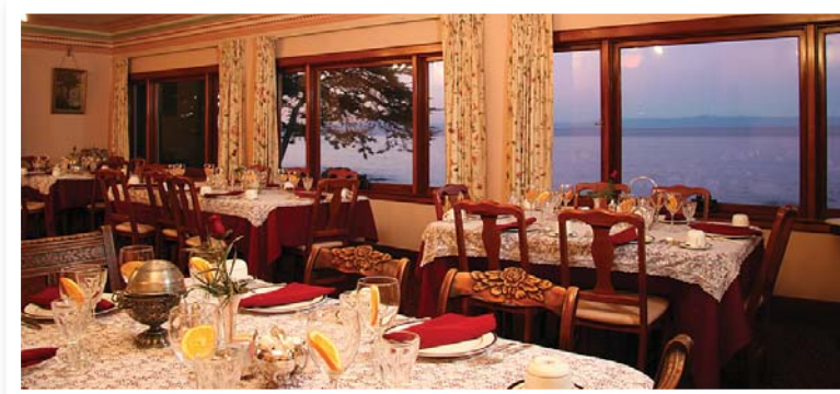
"...an elegant bed & breakfast...cozy and intimate...appealing decor...spectacular bay view." - Barbara Fairchild, Bon Appetit