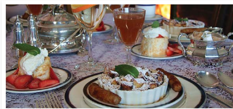
"A cliff-top mansion overlooking Monterey Bay boasts handsome rooms, museum-quality antiques and special amenities." - Glamour Magazine